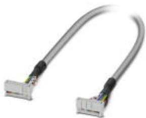
Round cable set; connection 1: IDC/FLK socket strip (1x 14-position); connection 2: IDC/FLK socket strip (1x 14-position); cable length: 1 m

Please be informed that the data shown in this PDF Document is generated from our Online Catalog. Please find the complete data in the user's documentation. Our General Terms of Use for Downloads are valid ( http://phoenixcontact.com/download )